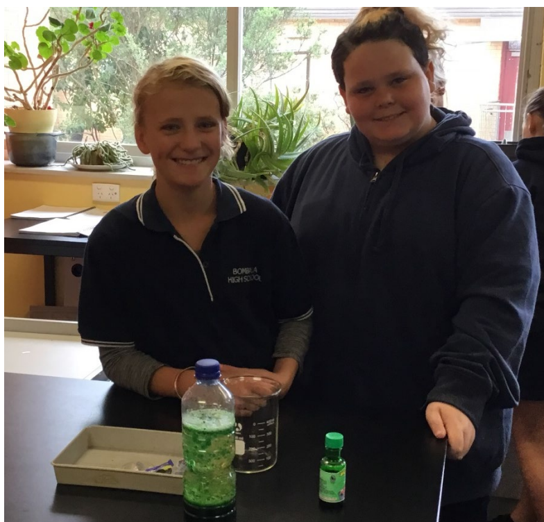
Yr 7 made lava lamps using water, oil, food colour and an antacid tablet.