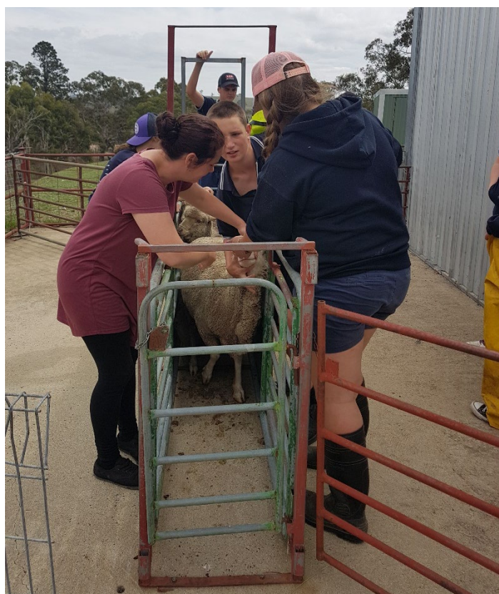
9/10 Ag drenched our sheep before drafting the lambs off for weaning so the ewes can be joined.